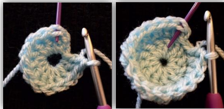
Round 1 join (left); Round 2 join (right)

Round 2: ch1, 2hdc in same st., 2 x hdc, (2hdc, hdc x 2) 3 times, join to 1 st st with sl. st. [16]